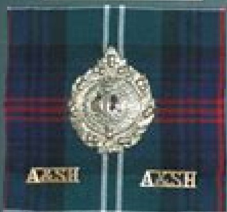
THE ARGYLL AND SUTHERLAND HIGHLANDERS