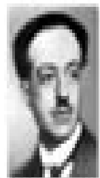
Louis de Broglie