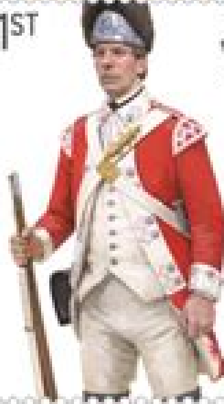
Grenadier, Chatham Division, His Majesty's Marine Forces, 1775