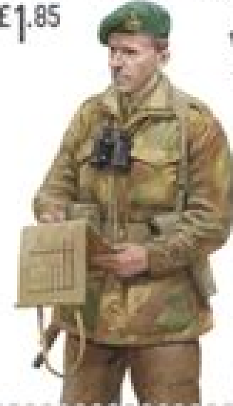
Officer, 40th Royal Marine Commando, 1944