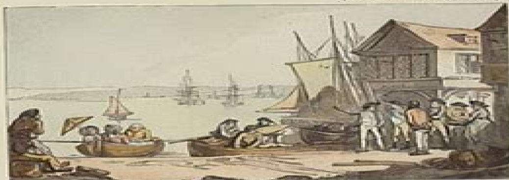
General view of the Bay of Wight, looking from the entrance, between the forts.

Bournemouth is a very pretty place for the day. The Bay is very beautiful and full of boats. The cliffs are very high and the water is very blue. The ships are very large and the people are very kind. The view is very beautiful and the air is very fresh. The people are very friendly and the food is very good. The ships are very fast and the people are very smart. The view is very beautiful and the air is very fresh. The people are very friendly and the food is very good. The ships are very fast and the people are very smart.