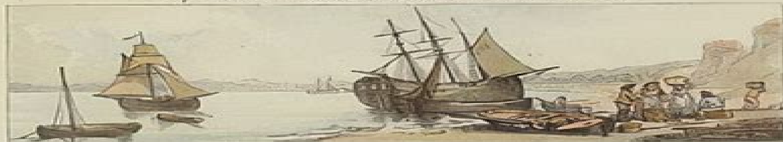
General view of the Bay of Wight, looking from the entrance, between the forts.