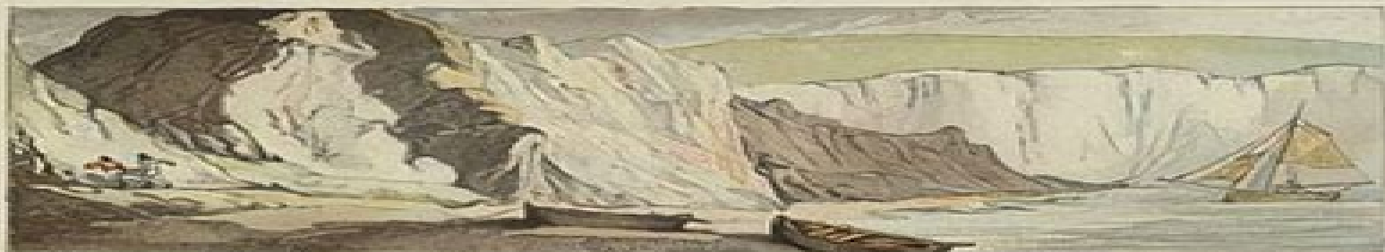
View of the cliffs from Bournemouth. The cliffs are composed of chalk, and the water is of a deep blue color.