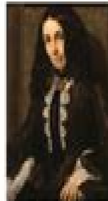
Elizabeth Barrett Browning