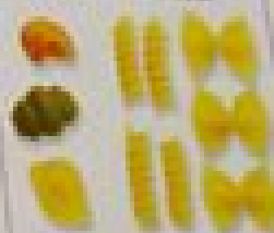
different shapes of pasta

noun an Italian food, usually made from wheat flour and water.