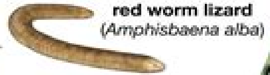
red worm lizard ( Amphisbaena alba )