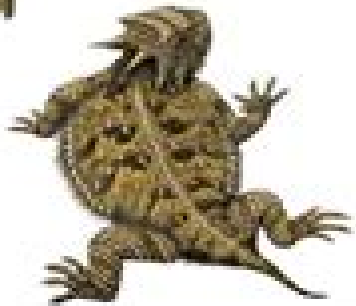
Texas horned lizard ( Phrynosoma cornutum )