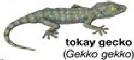
tokay gecko ( Gekko gekko )