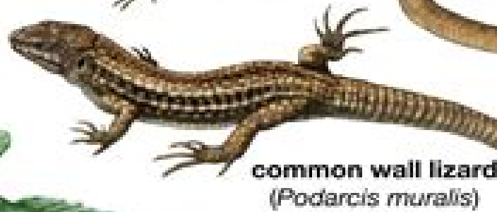
common wall lizard ( Podarcis muralis )