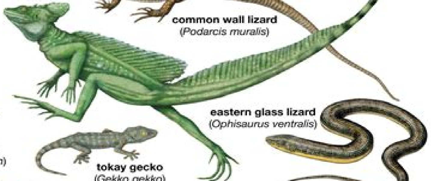
eastern glass lizard ( Ophisaurus ventralis )