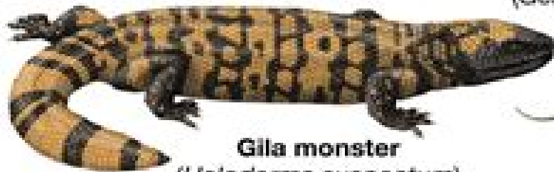
Gila monster ( Heloderma suspectum )