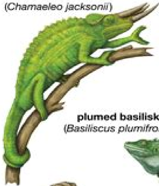
plumed basilisk ( Basiliscus plumifrons )