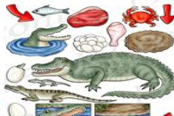
Crocodile Life Cycle Clipart