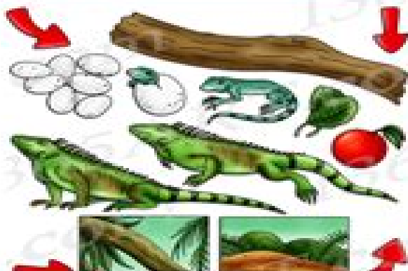
Iguana Life Cycle Clipart