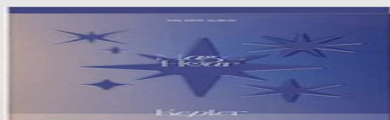
SLEEVE CASE 187.5×216mm