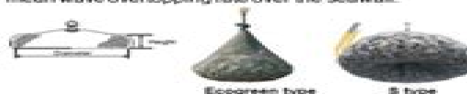
Figure 1 -Kyowa Rock Bags

Stage 2 of testing examined distinctive aspects of the Stockton Beach design following the commencement of its construction. Design wave and water level conditions specific to Stockton Beach were used to examine how two different structure slope and crest elevation options affected the hydraulic stability of the Rock Bags and the mean wave overtopping rate over the seawall.