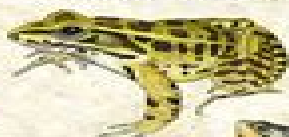
NORTHERN LEOPARD FROG Lithobates septentrionalis