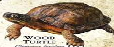
WOOD TURTLE Glyptemys insculpta