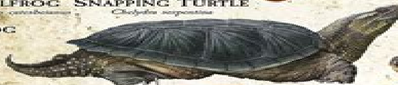
COMMON SNAPPING TURTLE Chelydra serpentina