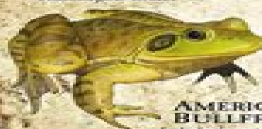
AMERICAN BULLFROG Lithobates catesbeianus