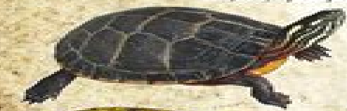
EASTERN PAINTED TURTLE Chrysemys picta picta