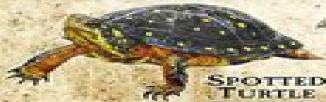
SPOTTED TURTLE Clemmys guttata