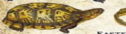
EASTERN BOX TURTLE Terrapene carolina carolina