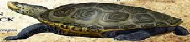
NORTHERN DIAMONDBACK TERRAPIN Malaclemys terrapin terrapin