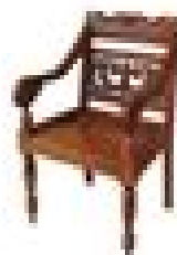
Colonial Furniture 1500-1754AD