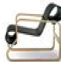
Bauhaus Furniture 1919-1933AD