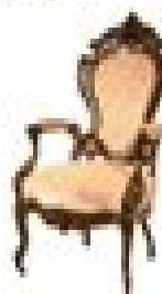
Revival Furniture 1800-1900AD