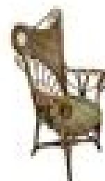
Art Nouveau Furniture 1890-1914AD