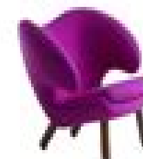
Modern Furniture 1935-1945AD