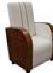
Art Deco Furniture 1925-1940AD