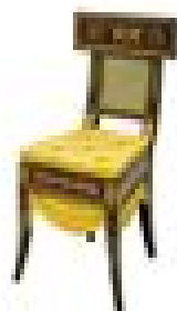
Ancient Greek Furniture 2000-300BC