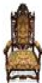
Jacobean Furniture 1567-1625AD