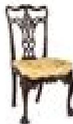
Rococo Furniture 1725-1775AD