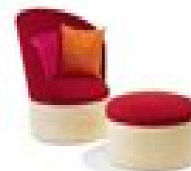
Contemporary Furniture 1980-Present