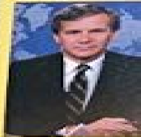
Introduction by Tom Brokaw

Follow the latest developments in Africa, Asia and Central America in this unique almanac and atlas.