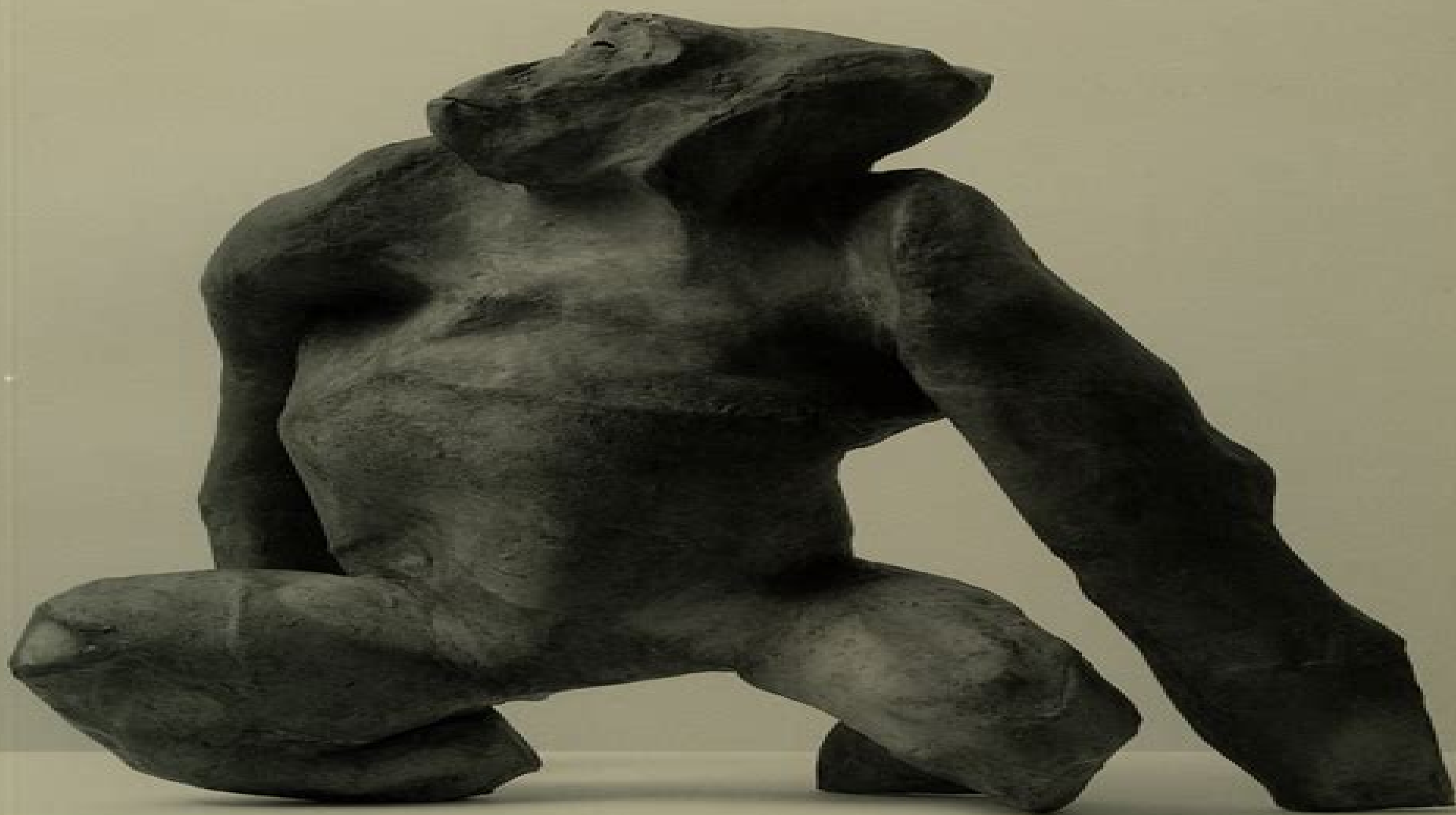
Next of Kin : Looking at the Great Apes