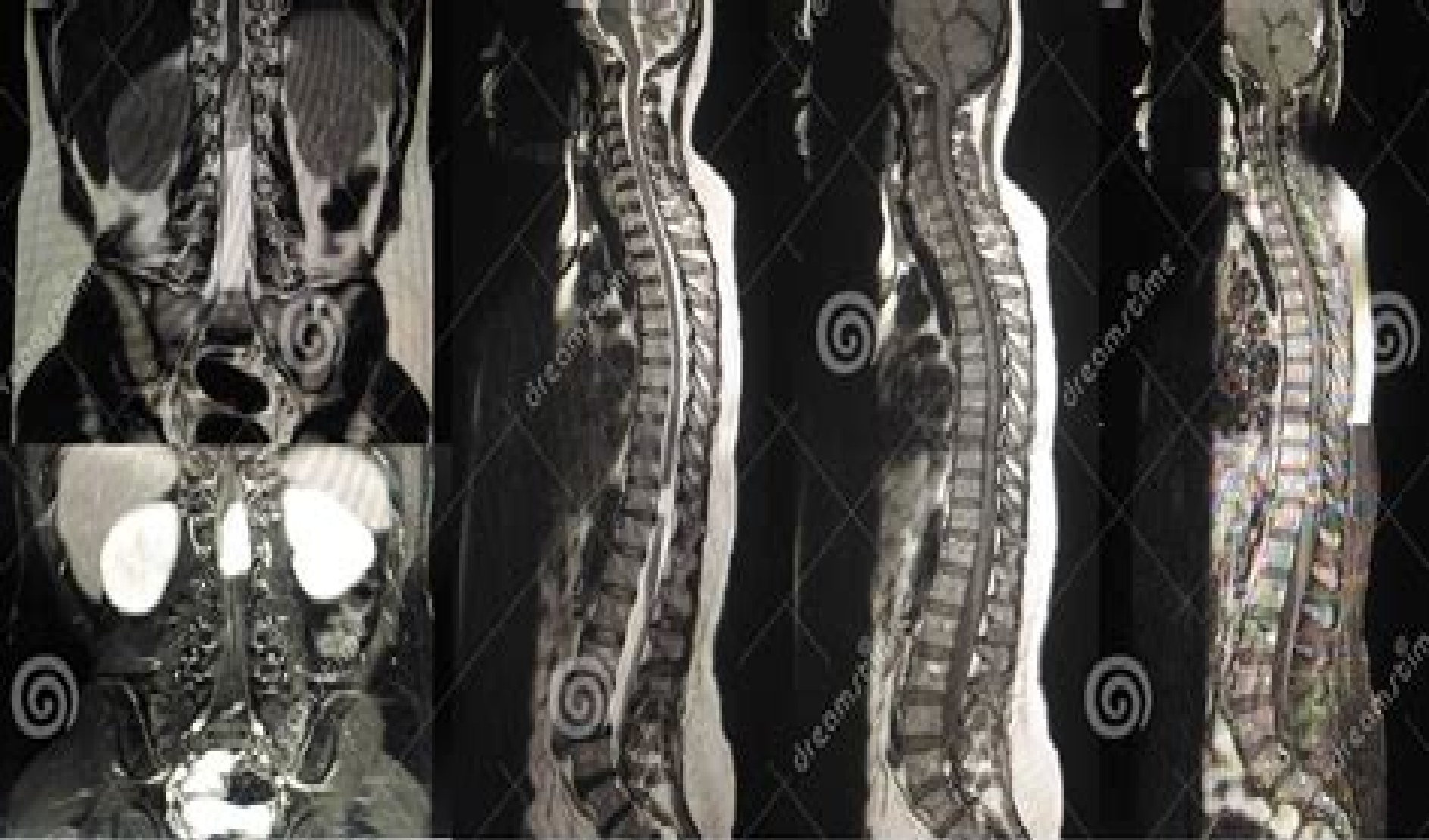
Magnetic Resonance Imaging(MRI):Whole Spine