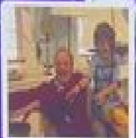
Shake Up and Shape Up