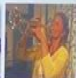
A Tuneful Toot on a Trumpet