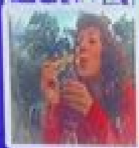
Troubles for Bubbles