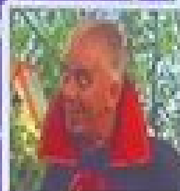
Mr. Marveloso's Magic Show