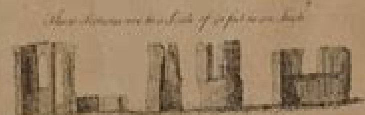
Section through the Choir and Chancel