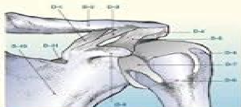
SHOULDER – ANTERIOR CLOSE-UP