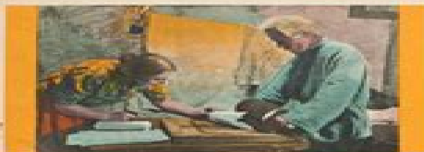
В подпольной типографии

Май — август 1903 г. Всеобщая стачка на юге России (более 200.000 участников), носившая политический характер, сопровождавшаяся многочисленными демонстрациями и митингами.