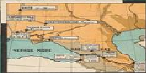
Карта Юга России с обозначением городов, участвовавших в общероссийской стачке мая 1903 г.