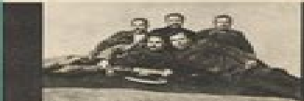
Группа рабочих, вышедшая в демонстрацию в Петербурге в начале 1903 г.