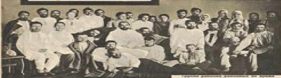
Группа рабочих, вышедшая в демонстрацию в Петербурге в начале 1903 г.