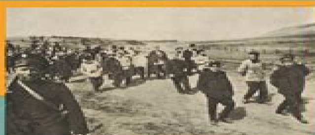
Группа рабочих, вышедшая в демонстрацию в Петербурге в начале 1903 г.