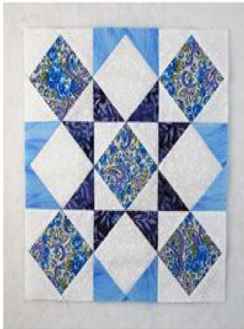
Kansas Star Quilt Block