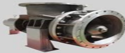
Axial Flow Pump