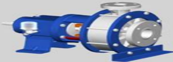
Radial Flow Pump