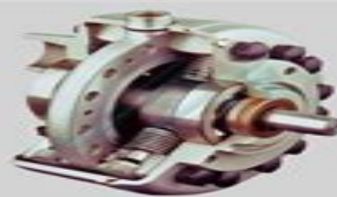
Radial Piston Pump