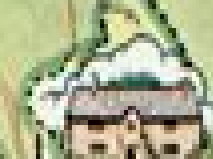
HOME OF GEORGE WASHINGTON'S FAMILY

RIDE A COCK-HORSE TO BANBURY CROSS, TO SEE A FINE LADY UPON A WHITE HORSE