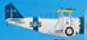
F3F-1 Fifi First Flight, 1931