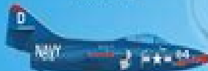
F9F Panther First Flight, 1947