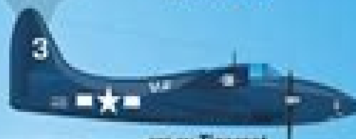
F7F Tigercat First Flight, 1942