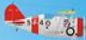
F3F-3 First Flight, 1935