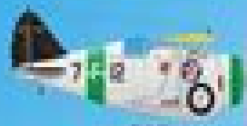
F3F-1 First Flight, 1931