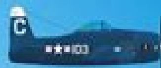
F8F Bearcat First Flight, 1944