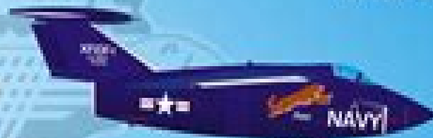
XF10F-1 Jaguar Prototype, 1952