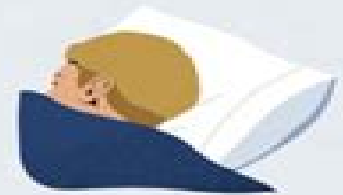
Loss of interest in masturbation