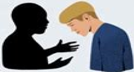
Little to no sexual desire