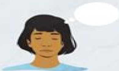
Lack of sexual thoughts or fantasies