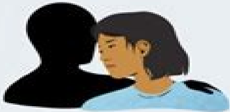
Reduced sexual arousal and receptiveness