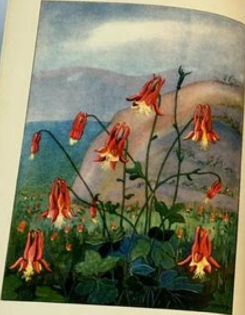
WILD COLUMBINE— Aquilegia canadensis