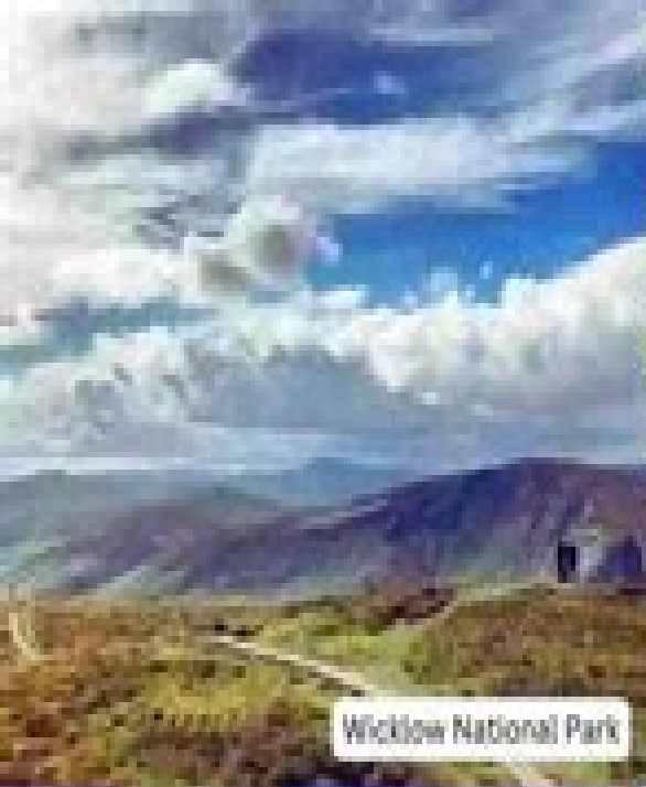
Wicklow National Park