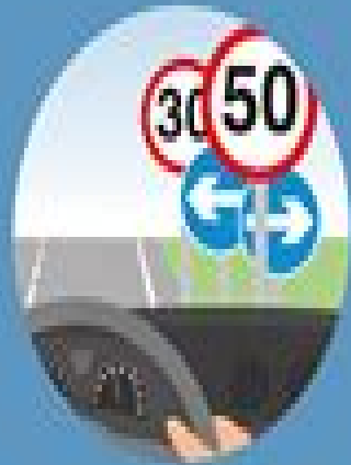
UNCLEAR TRAFFIC SIGNS