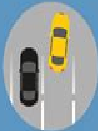
POOR LANE MARKINGS