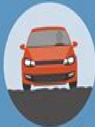
POOR ROAD SURFACES