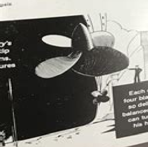
Each of the four blades are so delicately balanced, a man can turn with his hands.