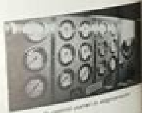
Engine room control panel in engine room