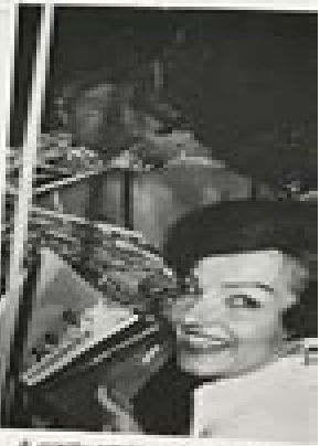
A pretty smile and pleasant menu at gala party.