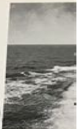
Cutting through water leaving No.