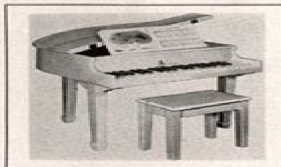
Modern 1947 Schoenhut Piano as it is shown in the salesrooms of Moseley & Abrahams in the Fifth Avenue Building, New York

TOY PIANOS, METALLOPHONES AND XYLOPHONES FOR 1947