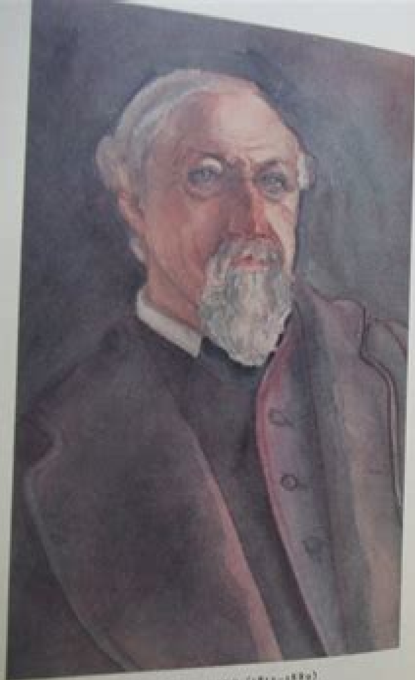
ROBERT BROWNING (1812-1889)