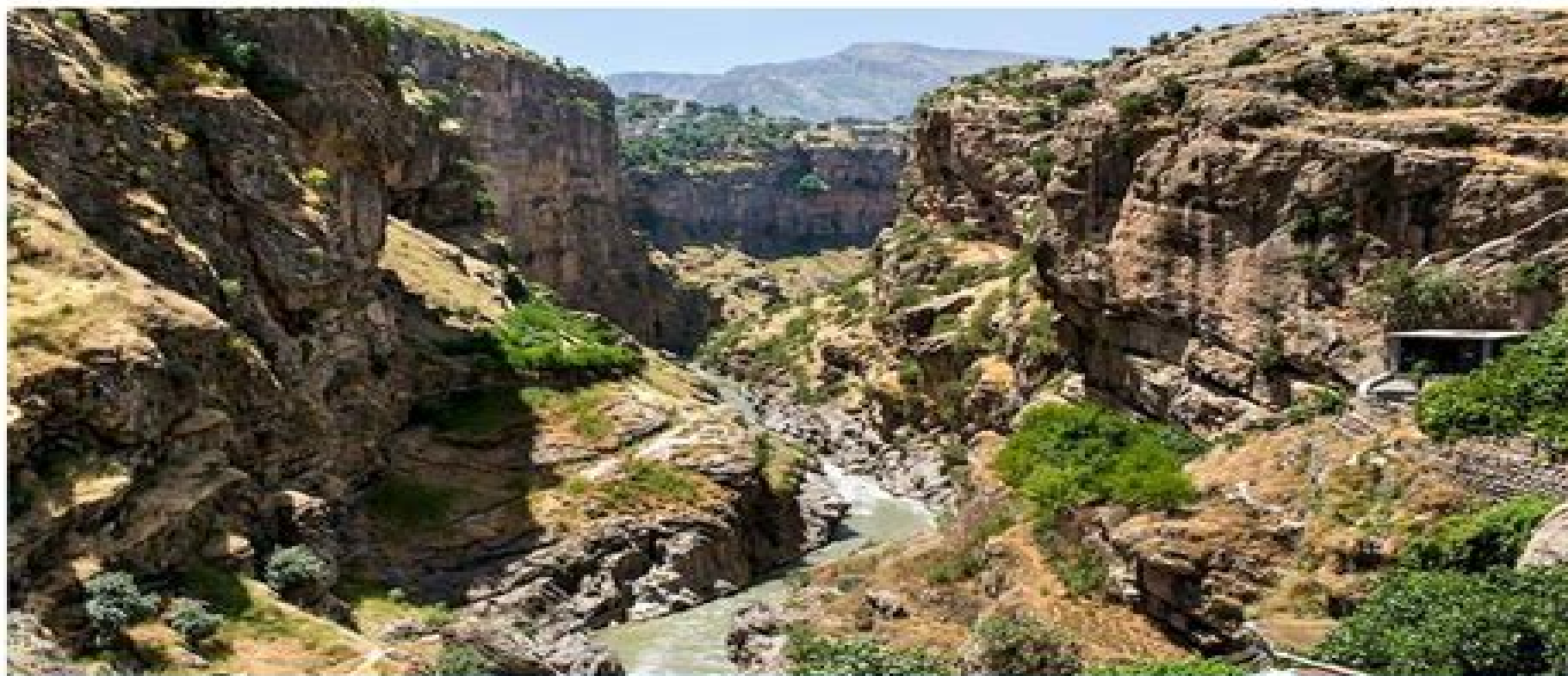
The city of Rawanduz.