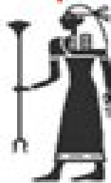
Vizier of Upper Egypt