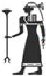
Vizier of Lower Egypt