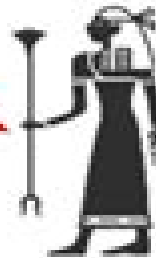
Viceroy of Kush