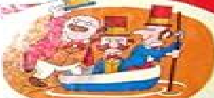
Three Men of Gotham