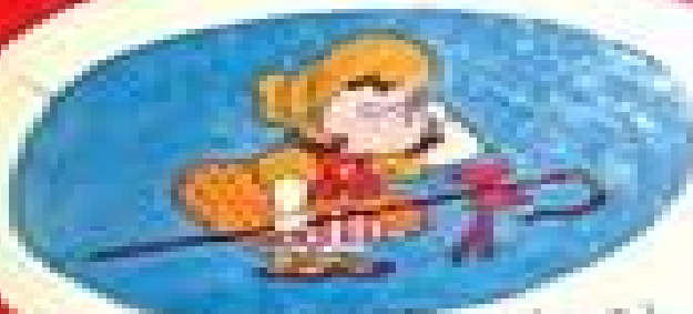
Little Bo Peep