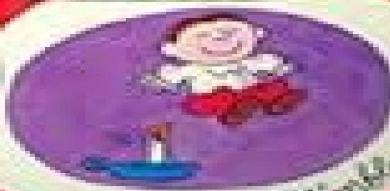
Jack Be Nimble