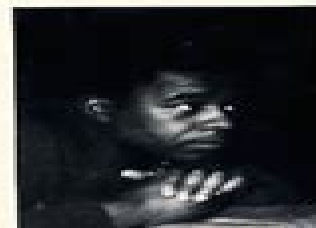
About the Author