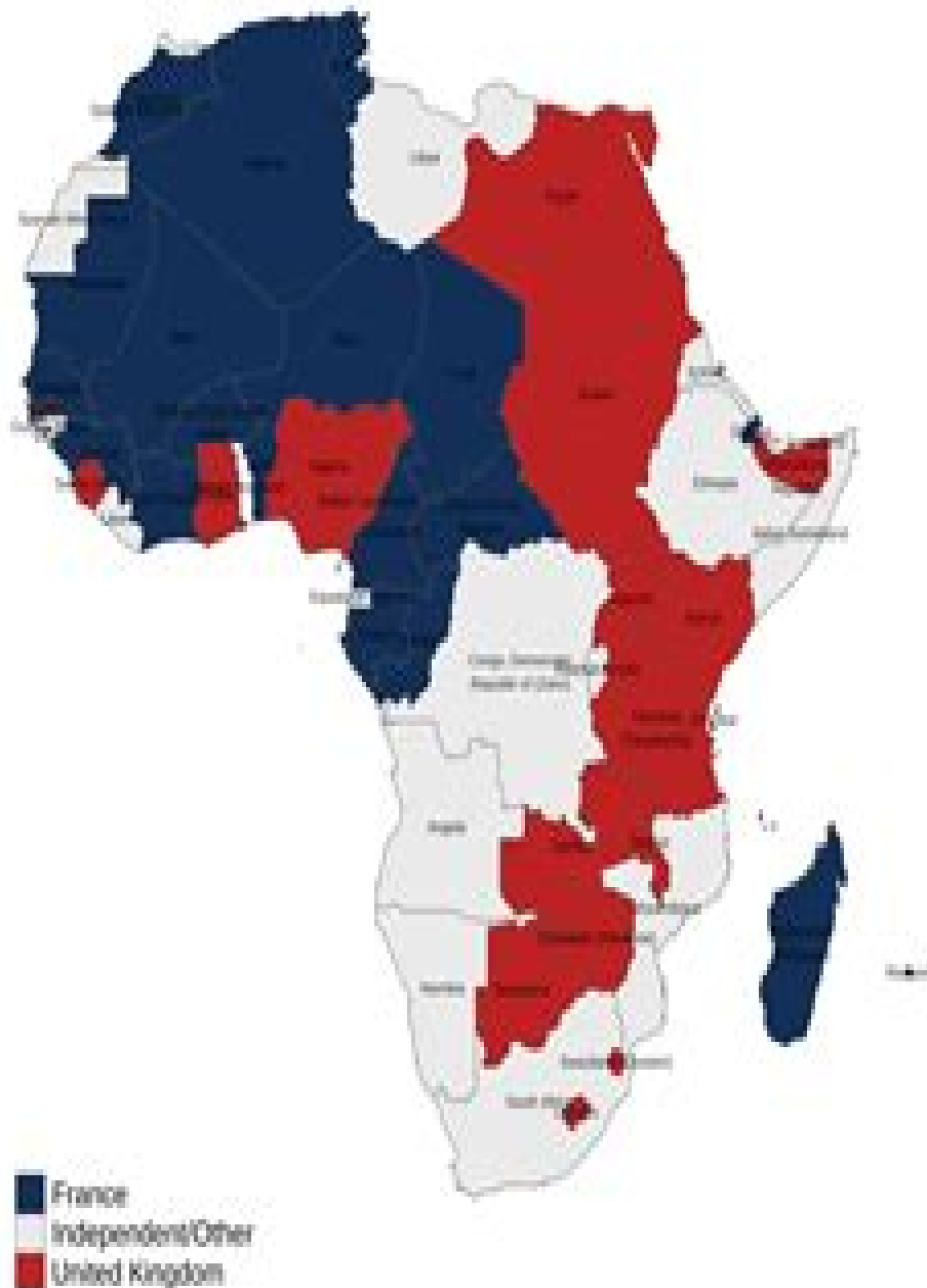
Most googled football team of PSG and Manchester United 2017-2022