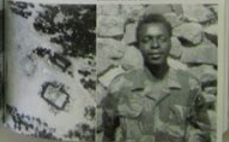
Below: A group of people, including a man in a military uniform, standing in front of a building.