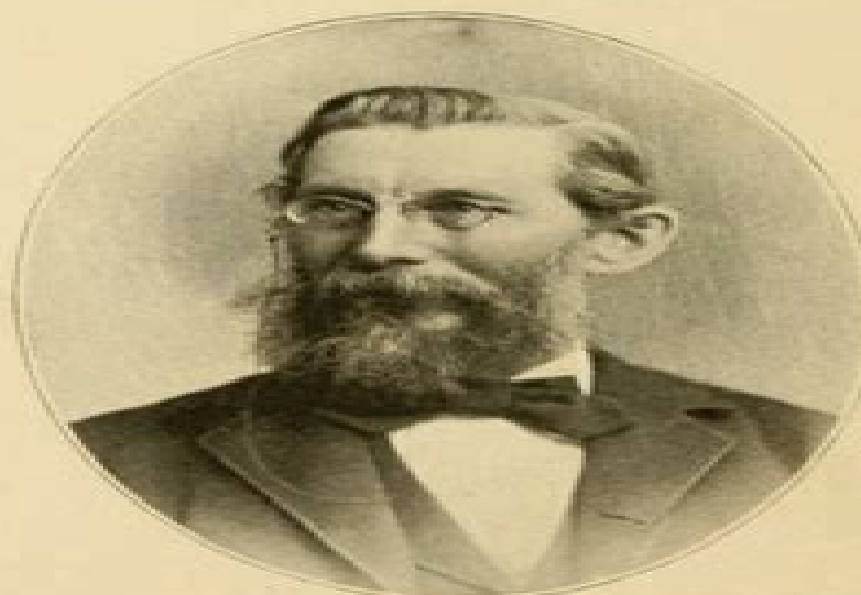
LEWIS EDSON WATERMAN PRESIDENT L. E. WATERMAN CO., IDEAL FOUNTAIN PENS INVENTOR OF THE FIRST SUCCESSFUL FOUNTAIN PEN