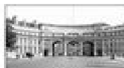
MARCH The Admiralty Arch, circa 1920