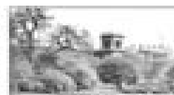
MAY St James's Park, circa 1960