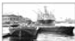
FEBRUARY Boats in the Royal Albert Docks, circa 1965