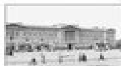
AUGUST Buckingham Palace, circa 1955