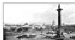
JANUARY Nelson's Column & Trafalgar Square, circa 1920

London has a fascinating history, which is brought to life in these wonderful images from The Francis Frith Collection. The twelve photographs in this calendar provide a window on the past, showing us how the face of London has changed over the decades, and how people lived their lives in this diverse and dynamic city.