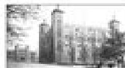
SEPTEMBER White Tower, The Tower of London, circa 1920