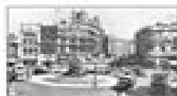
JUNE Piccadilly Circus, circa 1949