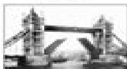
DECEMBER Tower Bridge, circa 1895

ENVELOPE INCLUDED LARGE LETTER POSTAGE SIZE