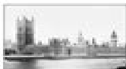
JULY Houses of Parliament, circa 1890