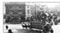
OCTOBER Elephant and Castle, circa 1885