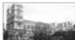
NOVEMBER Westminster Abbey from Dooms Day, circa 1900