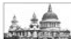
APRIL St Paul's Cathedral, circa 1910