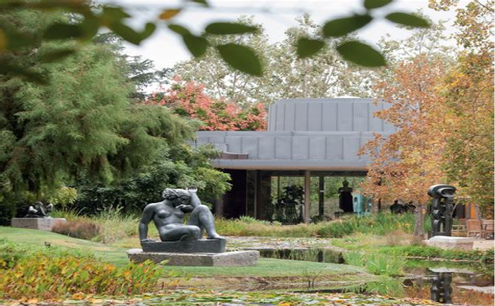
A Living Work of Art The Norton Simon Museum Sculpture Garden