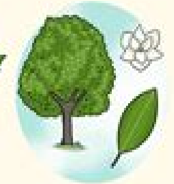
Southern magnolia ( Magnolia grandiflora )