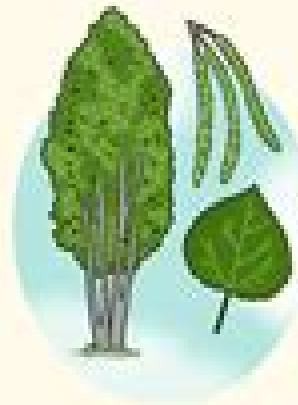
Quaking aspen ( Populus tremuloides )