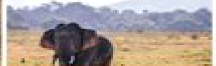
Sri Lankan Elephant