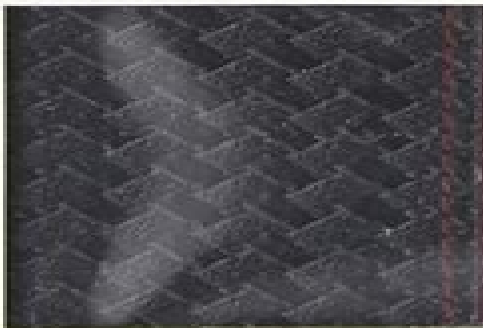
BONDED LEATHER Basketweave Pattern