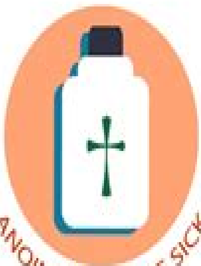
ANCOINTING OF THE SICK