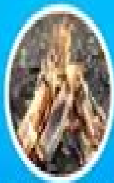
Burning of wood