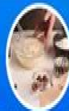
Baking of cake