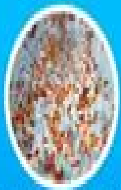
Rusting of Iron