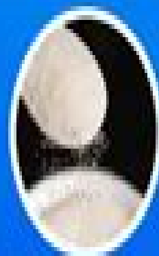
Mixing of sugar