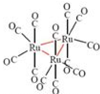
structure of Ru 3 (CO) 12

The simplest metal cluster contains the M 3 unit, held together by metal-metal bonds (rather than solely by bridging ligands). An example is Ru 3 (CO) 12 . The trigonal arrangement of metal atoms is reminiscent of the close-packing of spheres in bulk metal. The cluster Rh 6 (CO) 16 has an octahedral arrangement of metal atoms (with 12 terminal CO ligands and 4 triply-bridging CO ligands). The metal organization is analogous to the packing of two trigonal M 3 units in adjacent layers in bulk metal.