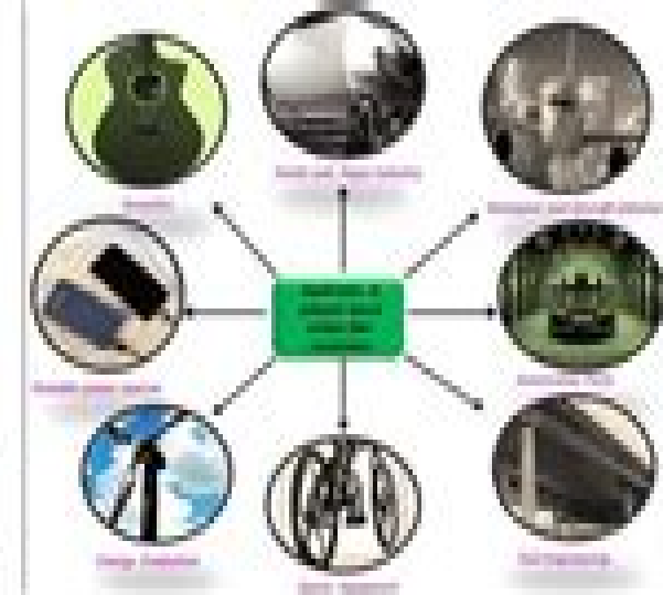
Structural composite materials