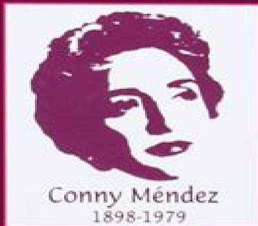
Conny Méndez 1898-1979

Aunque muchos libros han sido escritos basados en las «Leyes del Pensamiento», muy pocos son los que combinan estas leyes con la Verdad Espiritual. Es precisamente esta combinación la que constituye una renovación para el lector no especializado. La colección Metafísica Conny Méndez le ayudará a tomar el control de su vida, enseñándole a manejar su inmenso poder interior y guiándolo a través de canales constructivos, mientras que la salud y la prosperidad se incrementarán visiblemente.