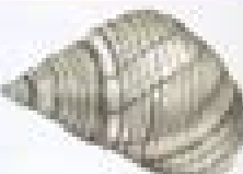
Marsh Periwinkle (CB,V)

Olivella septentrionalis To 2.5 in. (6.3 cm) high Olive, yellow to grayish cylindrical shell has markings that resemble lettering. South Carolina's state shell.