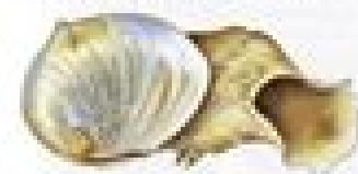
Solitary Glassy Bubble (V)

Conus septentrionalis To 3 in. (7.6 cm) Creamy shell has bands of red-brown splashes. Mouth is a long dagger out of the narrow end of the shell.