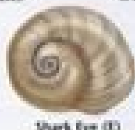
Shark Eye (E)

Tegula funiculata To 1 in. (2.5 cm) Rounded, black shell with a smooth apex.