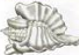
Foliate Thornmouth (W)

Nassarius lineatus To 2 in. (5.1 cm) high Large yellow-brown to yellow-gray shell has deep, beaded ridges and a pointed spine.