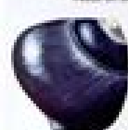
Black Top Shell (W)

Polinices bipartitus To 1 in. (2.5 cm) high Rounded shell is grayish to brownish, (dark to red) to bore holes into biofilms.