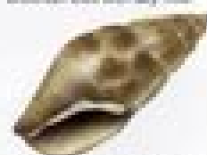
Carinate Downsail (W)

Chamaelea pumila To 4.5 in. (11.4 cm) Yellow-white to brownish shell has raised ribs but lacks long spines. Note brown spots on outer lip of shell.