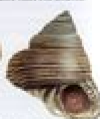
Ribbed Top Shell (W)

Hydrobia ulitiformis To 1 in. (2.5 cm) high Cone-shaped shell is blackish to brownish-gray. Feeds on biofilms.