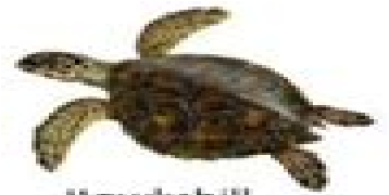
Hawksbill Sea Turtle